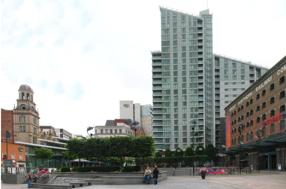
Great Northern Square, Manchester.