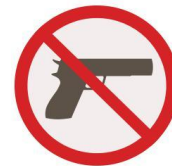
Rates of crime and anti-social behaviour