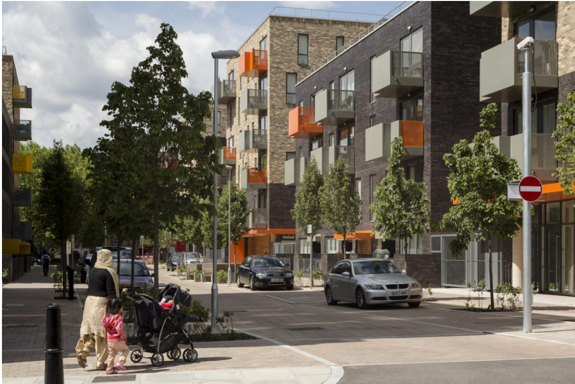
Ocean Estate, London Borough of Tower Hamlets.

The Ocean Estate is located in Stepney, Tower Hamlets, which is amongst the 10 per cent most deprived areas in England. Residents were disillusioned with past attempts at regeneration in the Estate, but were keen for the site to be improved, as it was blighted by street crime and the majority of housing was no longer fit for purpose.