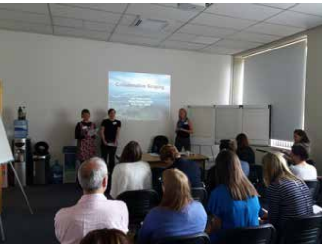
Image courtesy of Scottish Government - Scottish Government EIA Conference

Details of completed projects can be found here: https://www.gov.scot/policies/planning-architecture/latest