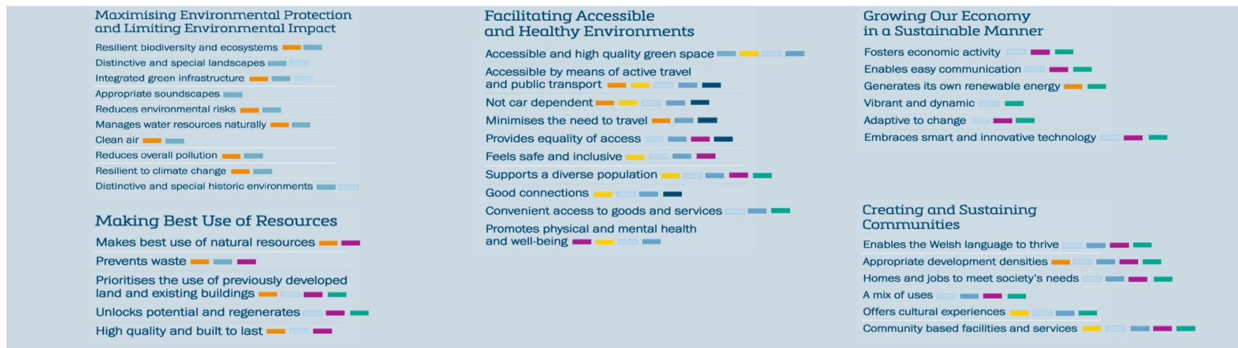
Figure 2: Alignment with Wales Wellbeing Goals, National Sustainable Placemaking Outcomes and the Toolkit themes.